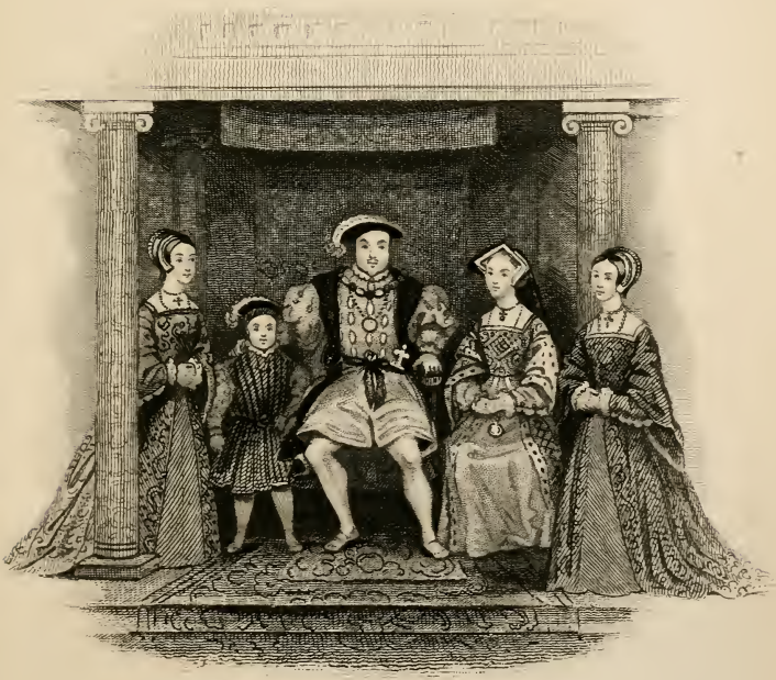
Henry VIII and his Family